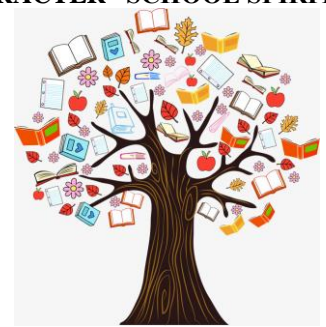
MONDAY, JANUARY 27th